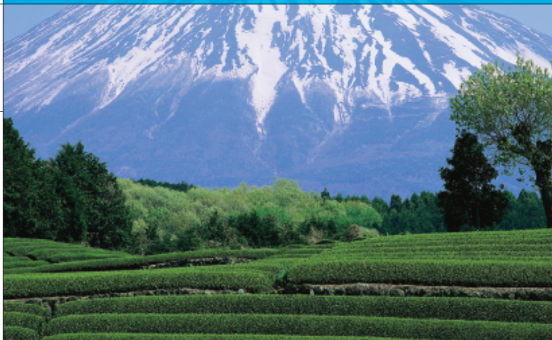
Mount Fuji is Japan's highest and most prominent mountain.

Journey to the Land of the Rising Sun to discover the unique cultural and unparalleled landscapes of Japan. Walk through sacred Shinto shrines, watch artisans fashion traditional crafts and ride the world-class bullet train. A visit to Japan lets you experience 11 centuries of history and cutting edge modernity, all in the same trip. Emerge with a comprehensive view of how Japan's culture and vibrant traditions influence the promising future of this ancient land.