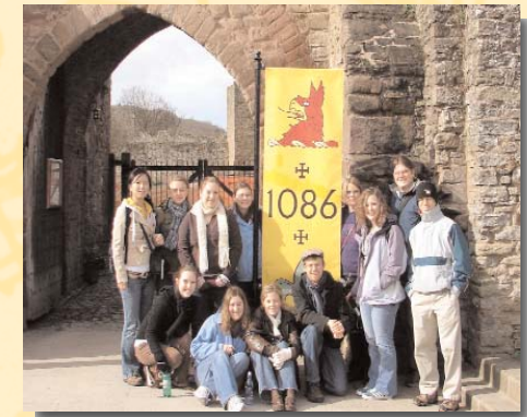
Northwestern College at Ludlow Castle