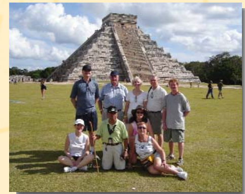
Discover Our Portfolio of Worldwide Destinations

Once full payment has been acknowledged (as being received within the stated currency guarantee level), your land rates cannot change. Once the airline tickets have been issued, the fuel and tax component at time of ticketing will be honored by the airline. In short, once final payment has been acknowledged and the group ticketed, there can be no price increases for any reason.