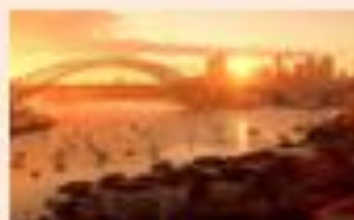
Cruise around Sydney Harbour