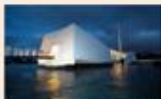
Visit Pearl Harbor